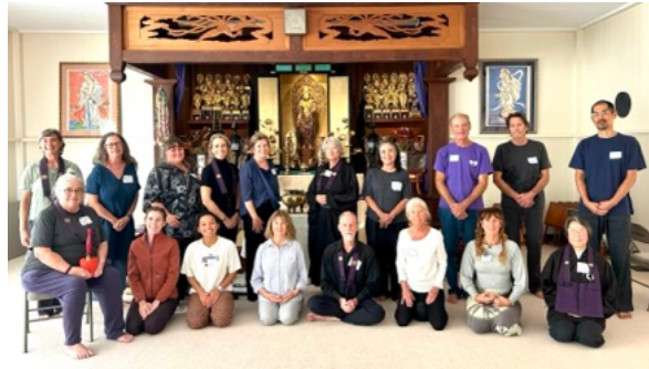
“A Day of Silence” Zen Retreat Held on October 11